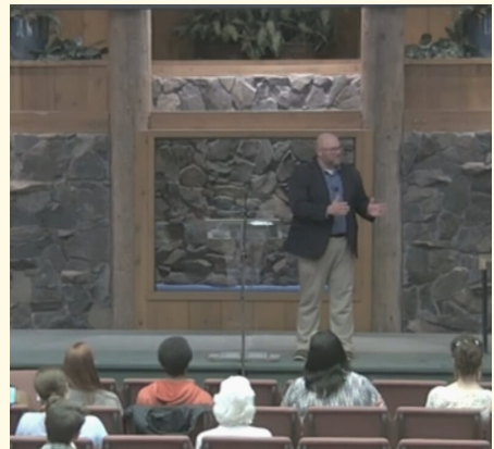
FaithBuilders in Washington