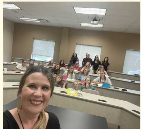
HORIZONS at Freed-Hardeman