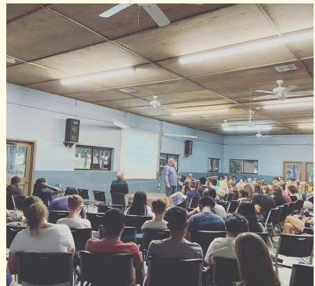
Central Florida Bible Camp